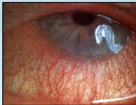
An eye with severe dry eye may appear red, watery and irritated.